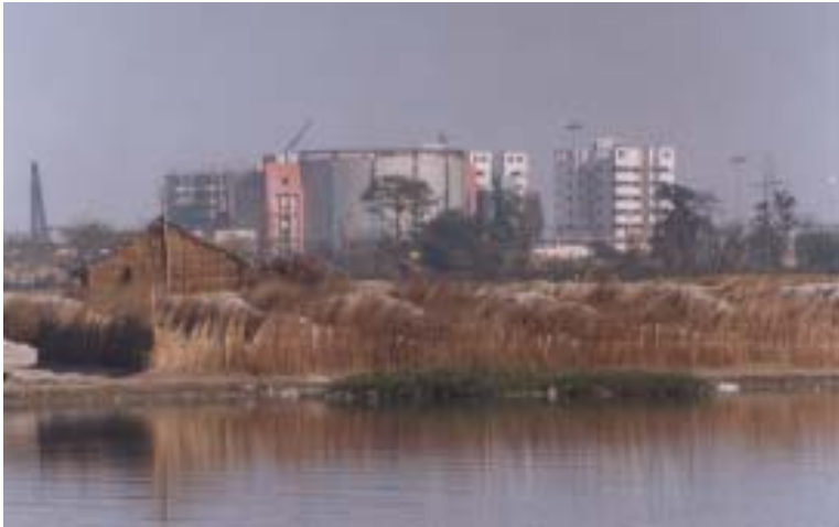
Metro Rail Headquarters