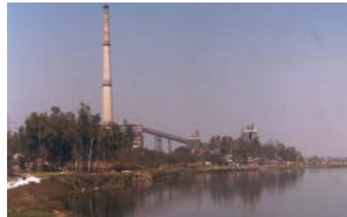
Rajghat Thermal Power Plant