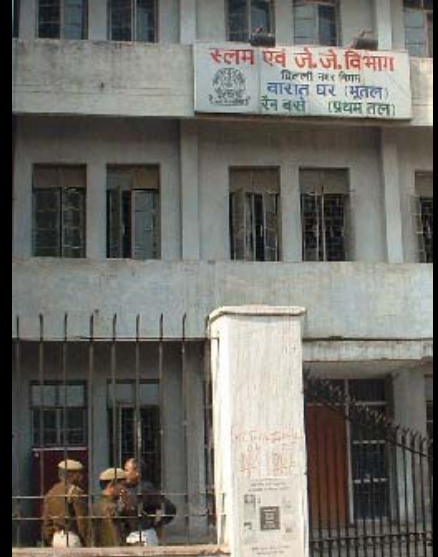
Ren Basera / Baraat Ghar at Shahazada Bagh, (near Shastri Nagar Metro Station) that serves as a place for detaining alleged illegal migrants.