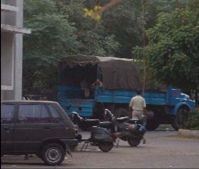
Police van with the alleged illegal migrants waiting in the compound of the FRRO office at R. K. Puram, while their deportation papers are prepared inside, and a Leave India Notice issued under the Foreigners Act